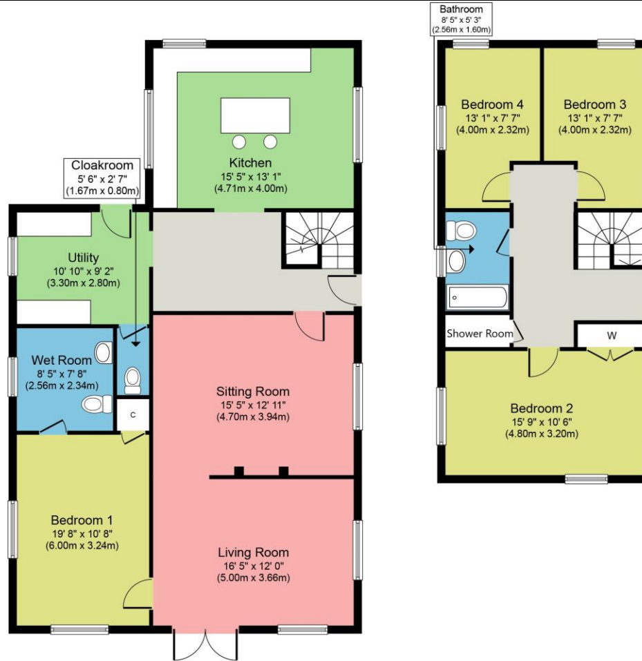
Ground Floor Approximate Floor Area 1,155 sq. ft. (107.3 sq. m.)